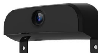
Thermal Sensor Module